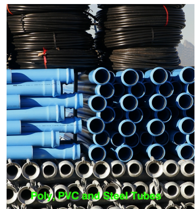
Poly, PVC and Steel Pipes

Wholesale & retail enquiries: Alfred Andrag ☎ 082 824 1214