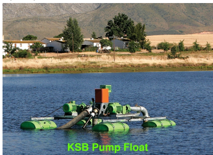
KSB Pump Float