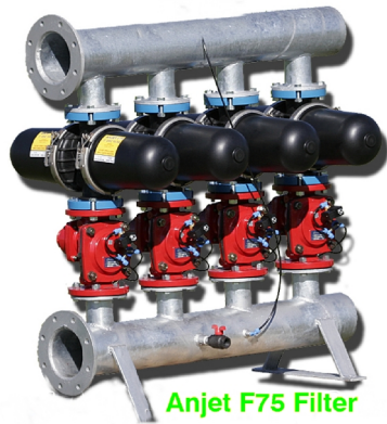
Anjet F75 Filter

Technical advice is part of the service, from surveying, through planning, to successful installation.